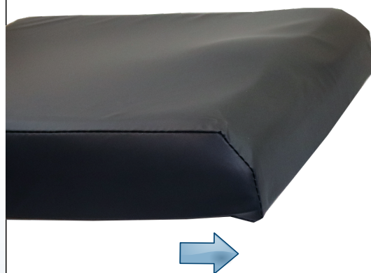
2 Front side