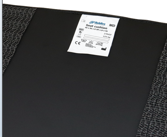
4 Label on underside