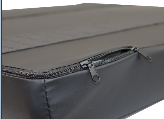
5 Zipper on backside