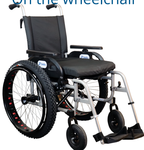
1 On the wheelchair