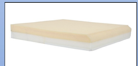
P4c. Viscoelastic foam

Seat cushion made from one layer of normal PU foam and one layer of visco-elastic foam. It comes with an incontinence cover. The cushion is deliverable in 5 different sizes from 40 to 50 cm.