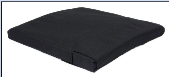
P3a. The cushion with the closed cover