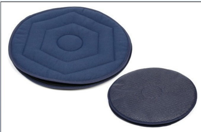
P6. Swivel seat with Ø 45 or 50 cm