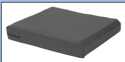
P4a. Incontinence cover