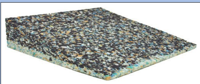
P8. Wedge made of regenerated foam