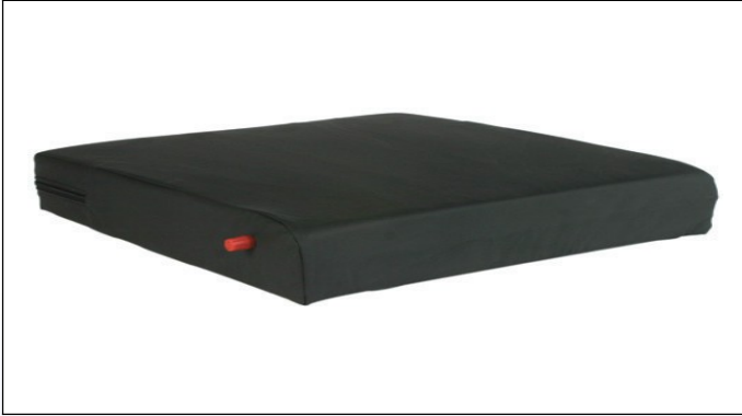
P5. Wheelchair cushion with valve for regulation of air pressure