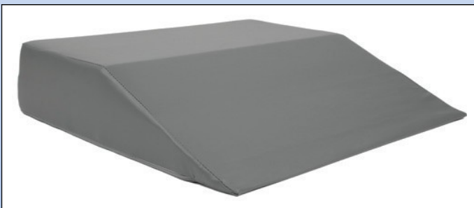
P7. Wedge with incontinence cover