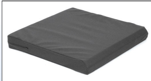
P2a. Cushion with incontinence cover