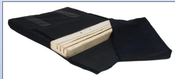
P3b. The cushion with the opened cover and the pre-cutted foam to adapt the seat depth

Universal wheelchair cushion made from high quality foam. The foam comes with precuts so that the cushion is easily adjustable to the depth of the wheelchair seat. The incontinence cover is equipped with velcro stripes for easy closing.