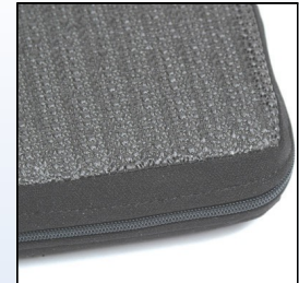
P2b. Anti-slip material

The cushions are available in the respective sizes of both polyurethane foam as high density viscose foam. The standard cushion (5 cm in height), is available with a black polyester or incontinence cover. All models are equipped with zipper and anti-slip bottom.