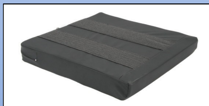
P4b. Anti-slip material