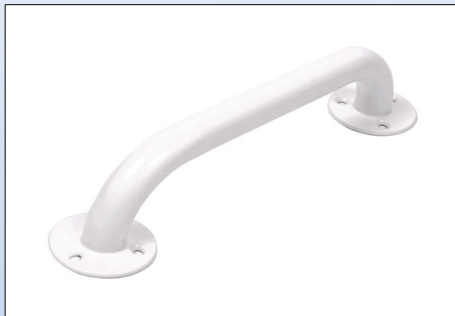
N3. Rilsan coated steel grab bar

The steel grab bars are coated with white Rilsan® and are available in lengths of 16, 25, 30, 45, 60, 75 or 90 cm.