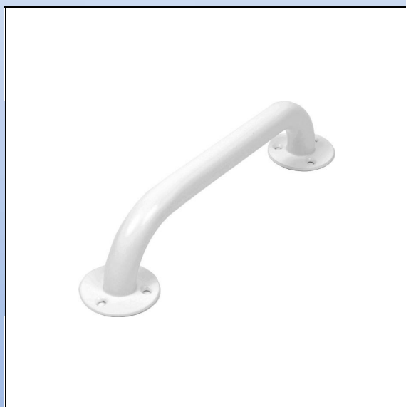
N3. Grab bar with Rilsan® cover

The grab bars made from steel are 25 mm in diameter. Max. load 150 kg depending of the wall where they are mounted.