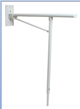
N4a. Foldable toilet support