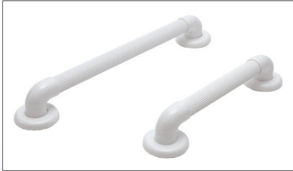
N1. Grab bar with ribbed surface