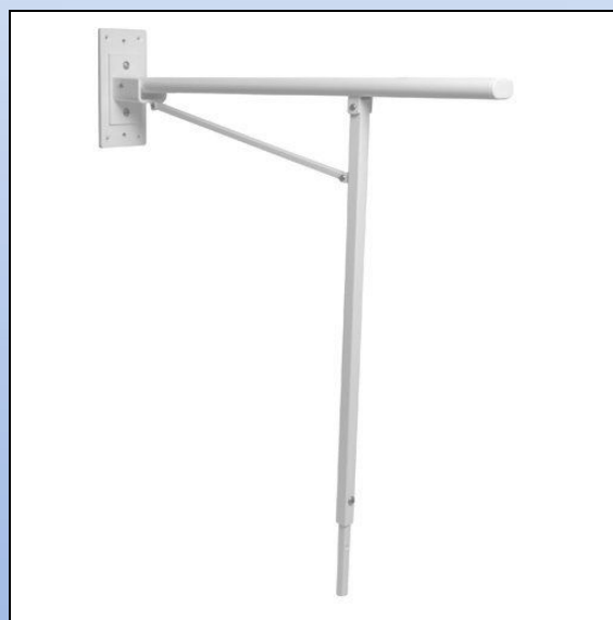
N4. Foldable toilet support with rilsan cover

The grab bars are available in the lengths: 16 cm, 25 cm, 30 cm, 45 cm and 60 cm