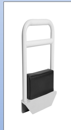
N5. Universal bed-grab made from steel

The universal bed-grab bar is a stand-up and relocation assistance tool which is clamped to the bed side wall. For bed side walls with a suitable thickness of 20-50 mm. The handle length is 195 mm. Weight: 4.7 kg.