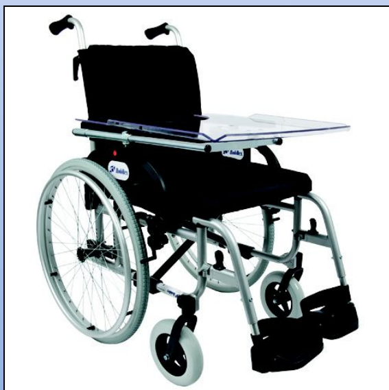
M2a. Therapy table in use

The size is 57 x 38 cm (W x D) with a cut-out of 8 cm.