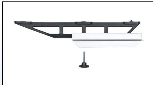
M1b. Fitting system