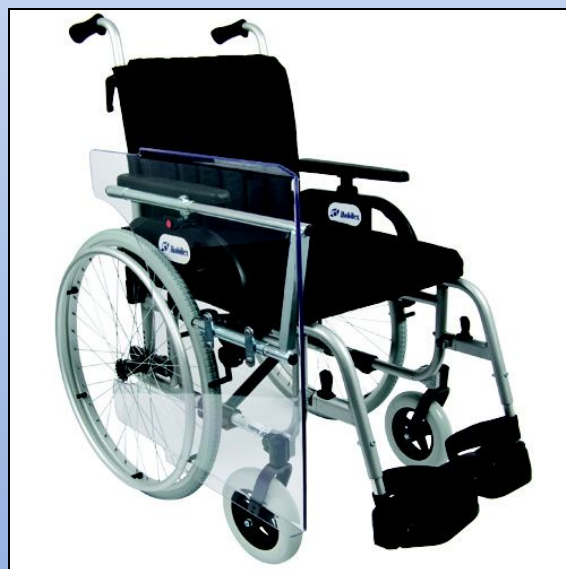
M2b. Therapy table folded