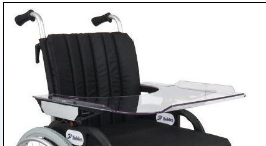
M1a. Therapy table

To be fitted on the armrest upholstery. Adjustable from 28 - 58 mm polstering height with a new designed system.