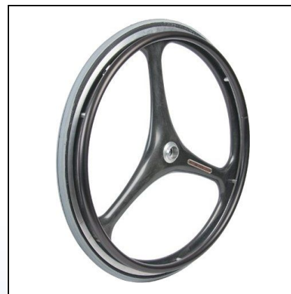
CX6. "X-Core" wheel

The wheel can be supplied as well with 12 mm hub as 1/2" hub. We stock 24" but the wheel is also available in 22".