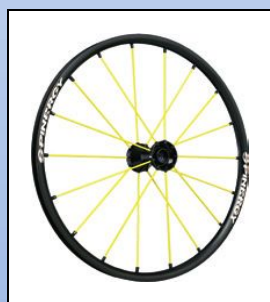
SPOX with yellow spokes