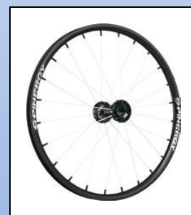
SPOX with white spokes