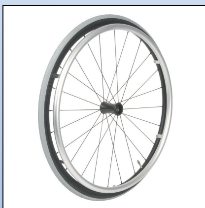
CX8. "Ultralite" wheel

The wheel can be supplied as well with 12 mm hub as 1/2" hub. We stock 24".