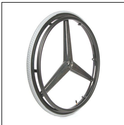
CX5. "Tristar" wheel

The wheel can be supplied as well with 12 mm hub as 1/2" hub. We stock 24" and 25", but the wheel is also available in 26" and 28"