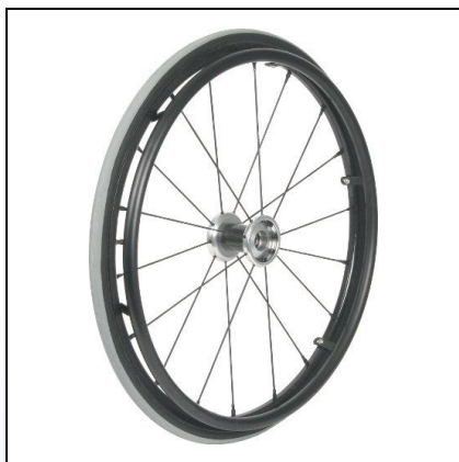
CX4. "Octopus" fibre wheel

The Octopus fibre wheel is a light weight wheel with a weight inclusive tyre/tube and push-rim of only 1420 grammes. The max. load is 75 kg. It is standard supplied with silver polished aluminium hub and quick release axle with push button, double walled black rim, black fibre spokes, black aluminium push-rim and 1" tyre.