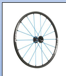
SPOX with blue spokes