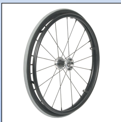
CX4 Typhoon wheel

X-Core is only available in 25". Can be supplied as well with 12 mm as 1/2" hub.