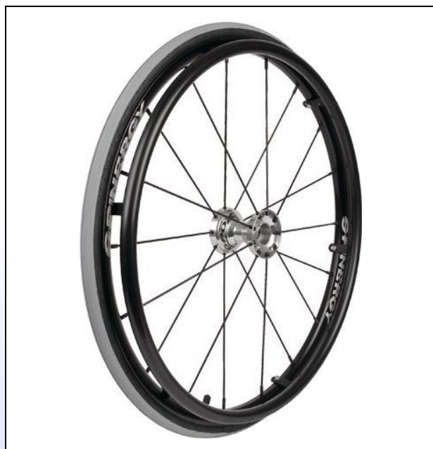
CX1. Spinerogy® SPOX Everyday wheel with 18 black spokes Complete with tyre/tube and pushrim.