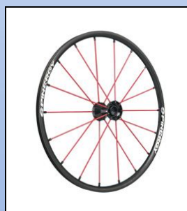
SPOX with red spokes